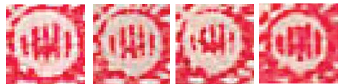
V Va VI VII