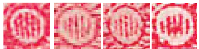
Ia II III IV