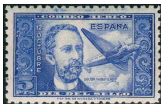
“Dr. Thebussem” on Spain C117, which was valid for postage on one day only, “Stamp Day” and “Day of the Race,” Oct. 12, 1944

Among the most curious bonafide postage stamps of the world are the private issues of “Dr. Thebussem,” designed and issued by himself between 1870 and 1890 exclusively for his personal use, and at the time having the same franking value in Spain and all Spanish Colonies as did the regular stamps issued by the government itself. These unique private stamps were discussed some 40 years ago in the Stamp Collectors Fortnightly of London, but are seldom heard of today.