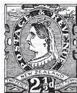
The cut from the 1891 article