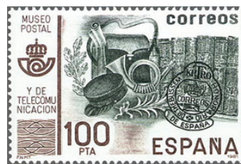
Spain Sc. 2275, from a souvenir sheet for the Madrid Postal Museum, shows one of "Dr. Thebussem's" stamps.

Another of the Doctor's literary gems related that postage stamp collecting began at an early date, and according to the legend "was started in Spain by a number of persons who formed themselves into a society for collecting, in order to assist a young girl who had been promised marriage by a Grandee, if she could cover the walls of one of the galleries in his palace with stamps. Collecting developed to such an extent that on May 27, 1862, a decree was issued prohibiting the circulation by post of packets containing stamps."