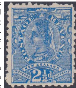
New Zealand 68