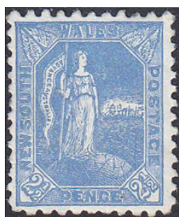
NSW Sc. 89

On January 1 next the reduced postal rate between the colonies and Great Britain and other countries will come into force. The charge of 2 1/2d per half-ounce letter will apply universally to all parts of the world except in cases where special foreign transit has to be accounted for. The letters will after the date named no longer be sent by what is known as the all-sea route and for which 4d per half-ounce is now charged; but they will go by the fast route, the charge for which at present is 6d