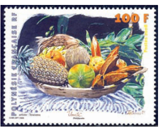
Fig. 12, left to right: 2008 fruits; 1948 definitive, fisherman with catch (Sc. 163); 1934 spear fishing (Sc. 83).