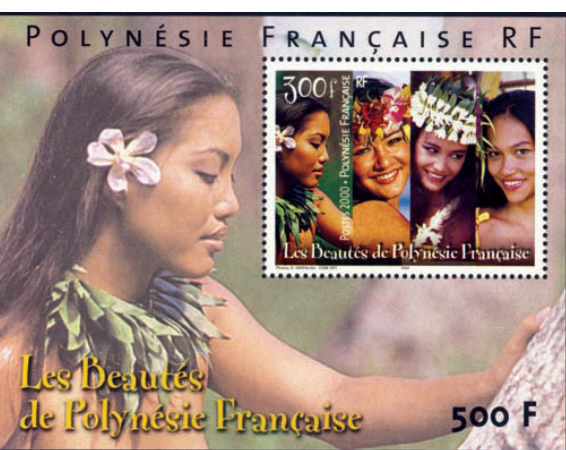
Fig. 21: 2000 Polynesian Women S/S (Sc. 778a)