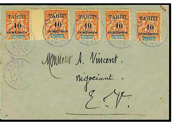
Fig. 31: 1907 cover with five copies of 10c on 40c, Tahiti Sc. 31, including gutter pair, tied by Papeete double-ring cancels