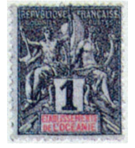
Fig. 29: FrPolynesia05: 1892 French Oceanic Settlements 1st issue (Fr. Poly. Sc. 1