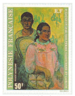
Fig. 14: 1978 "Tahitian Women and Boy" painting by Paul Gauguin (Sc. C159)