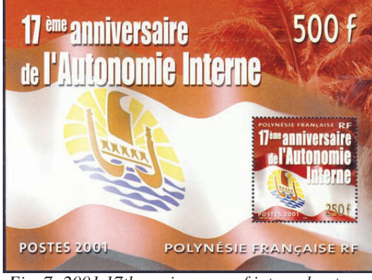
Fig. 7: 2001 17th anniversary of internal autonomy S/S (Sc. 804a)