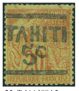
times on French Colonies overprint on French Col-20c (Tahiti Sc. 2)